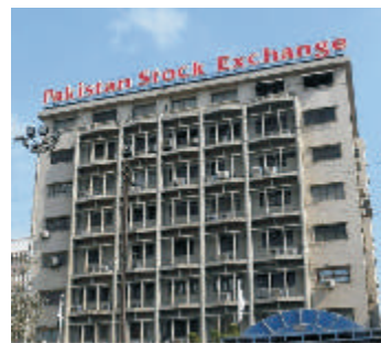
Pakistan Stock Exchange.

This award is presented to PSX for the first time in the 10-year history of the Global Islamic Finance Awards